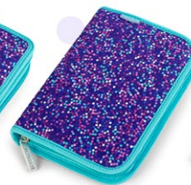
8869-56 ONEZIP bubbles