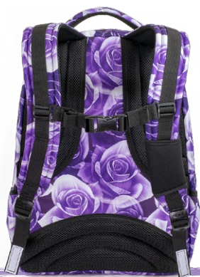
323-54 SURVIVOR purple rose