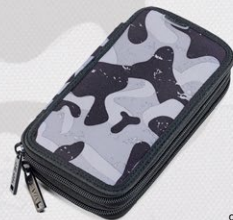
8865-67 TWOZIP combat