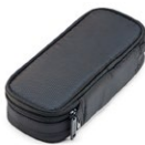
351-81 pure black