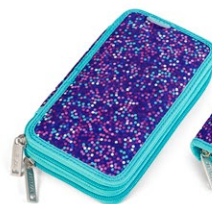
8865-56 TWOZIP bubbles