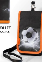
8871-55 SMARTPHONE COVER Scoute