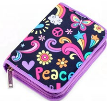
8869-64 ONEZIP peace pop