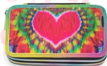
8865-58 TWOZIP rainbow