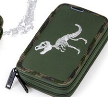
8865-59 TWOZIP T-rex