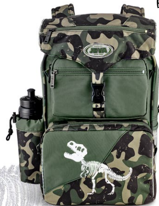
313-59 BEGINNERS T-rex