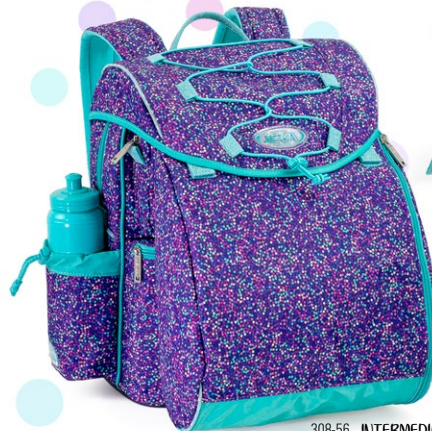
308-56 INTERMEDIATE bubbles