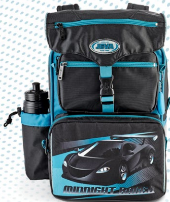
313-57 BEGINNERS midnight racer