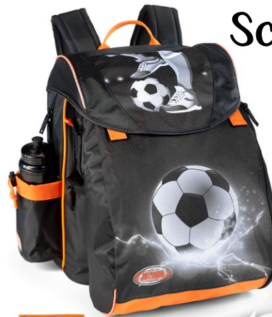
308-55 INTERMEDIATE Scoute