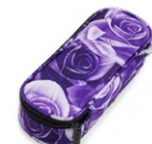
351-54 purple rose