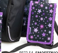
8873-54 SMARTPHONE COVER cassiopeia