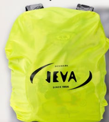
002-02 RAINCOVER yellow

For stormy conditions, our popular RAINCOVER with elastic fits all bags without the need for adjustment. Choose between black, silver or yellow.