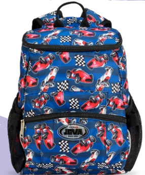
274-51 mini race

WEIGHT: 305 GRAMS MEASUREMENTS: H31 X W24 X D12 CM