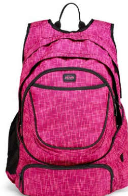
651-80 BACKPACK XL pink