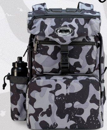
313-67 BEGINNERS combat