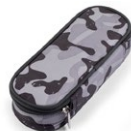
351-42 dark camou