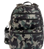
324-41 green camou