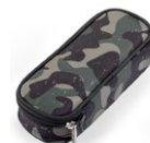
351-41 green camou