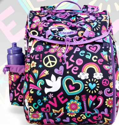
308-64 INTERMEDIATE peace pop