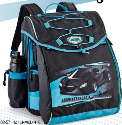
308-57 INTERMEDIATE midnight racer