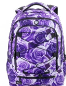
323-54 purple rose