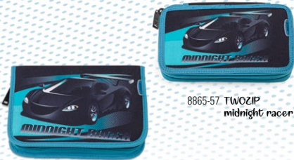
8865-57 TWOZIP midnight racer