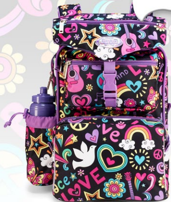
313-64 BEGINNERS peace pop