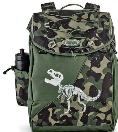
308-59 INTERMEDIATE T-rex