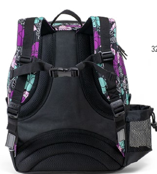
324-34 SQUARE Flora