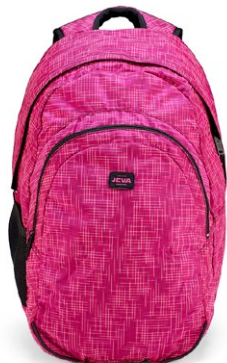
650-80 BACKPACK pink