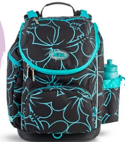
401-85 U-TURN hibiscus