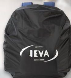
002-01 RAINCOVER black