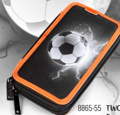
8865-55 TWOZIP Scoute