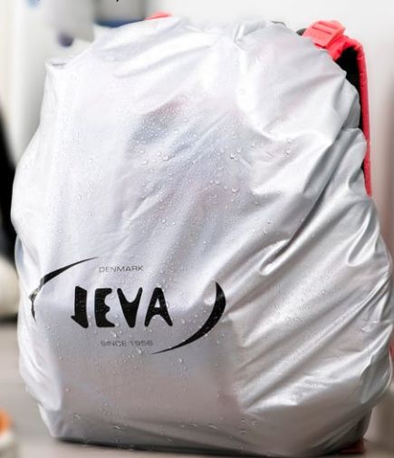
002-04 RAINCOVER silver