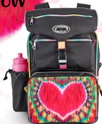
313-58 BEGINNERS rainbow