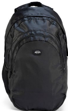
650-81 BACKPACK pure black

WEIGT: 500 GRAMS MEASUREMENTS: H50 X W34 X D25 CM