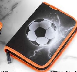
8869-55 ONEZIP Scoute