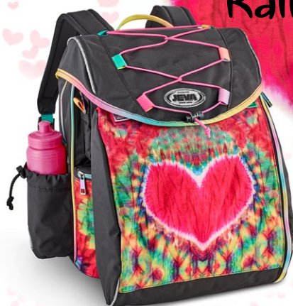
308-58 INTERMEDIATE rainbow