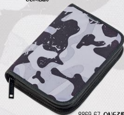
8869-67 ONEZIP combat