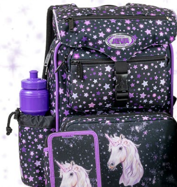
8865-54 TWOZIP cassiopeia