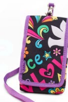
8871-64 SMARTPHONE COVER peace pop