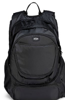
651-81 BACKPACK XL pure black

WEIGHT: 670 GRAMS MEASUREMENTS: H50 X W32 X D22 CM