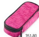
351-80 BOX pink

WEIGHT: 670 GRAMS MEASUREMENTS: H50 X W32 X D22 CM