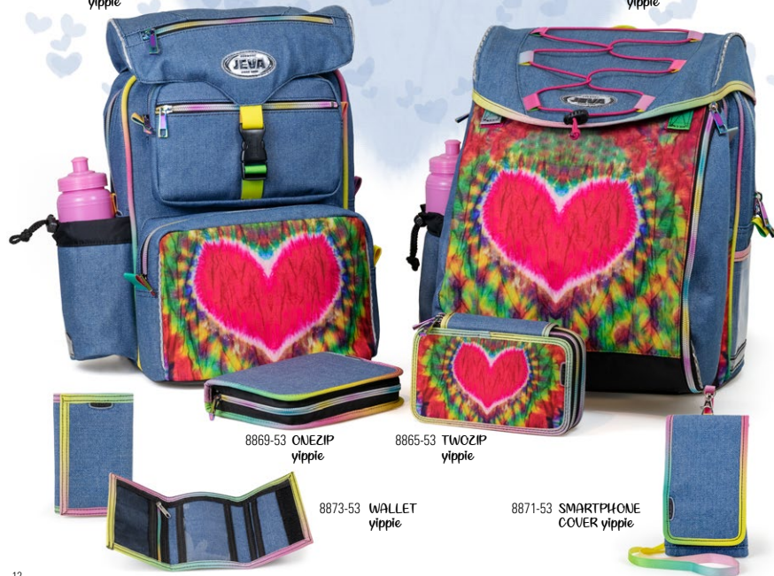
8869-53 ONEZIP yippie