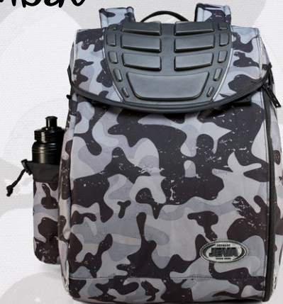
308-67 INTERMEDIATE combat