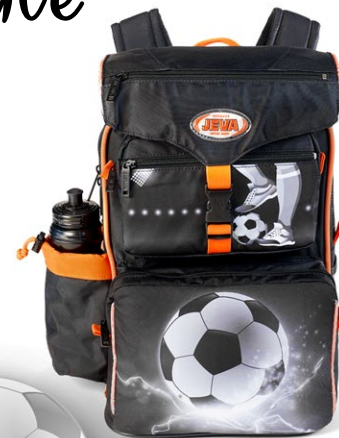
313-55 BEGINNERS Scoute