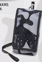
8871-67 SMARTPHONE COVER combat