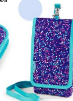
8871-56 SMARTPHONE COVER bubbles