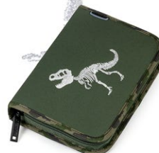
8869-59 ONEZIP T-rex