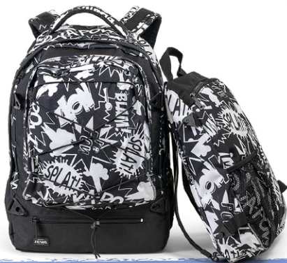
326-35 SUPREME ka-pow