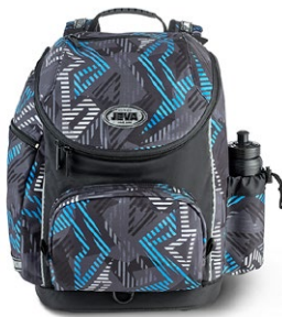
401-83 U-TURN cartoon