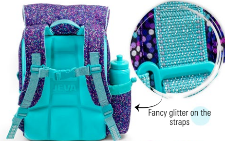
313-56 BEGINNERS bubbles