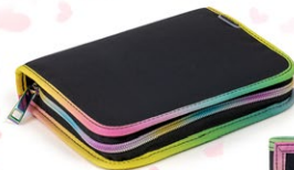
8869-58 ONEZIP rainbow