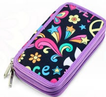
8865-64 TWOZIP peace pop