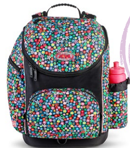
401-84 U-TURN meadow