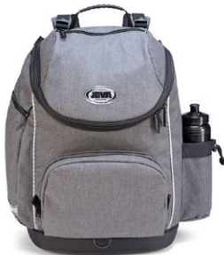
401-61 U-TURN denim