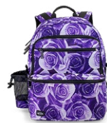
324-54 purple rose