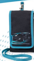
8871-57 SMARTPHONE COVER midnight racer