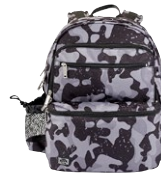
324-42 dark camou