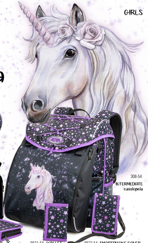
308-54 INTERMEDIATE cassiopeia