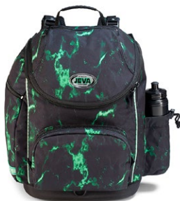
401-60 U-TURN amazon